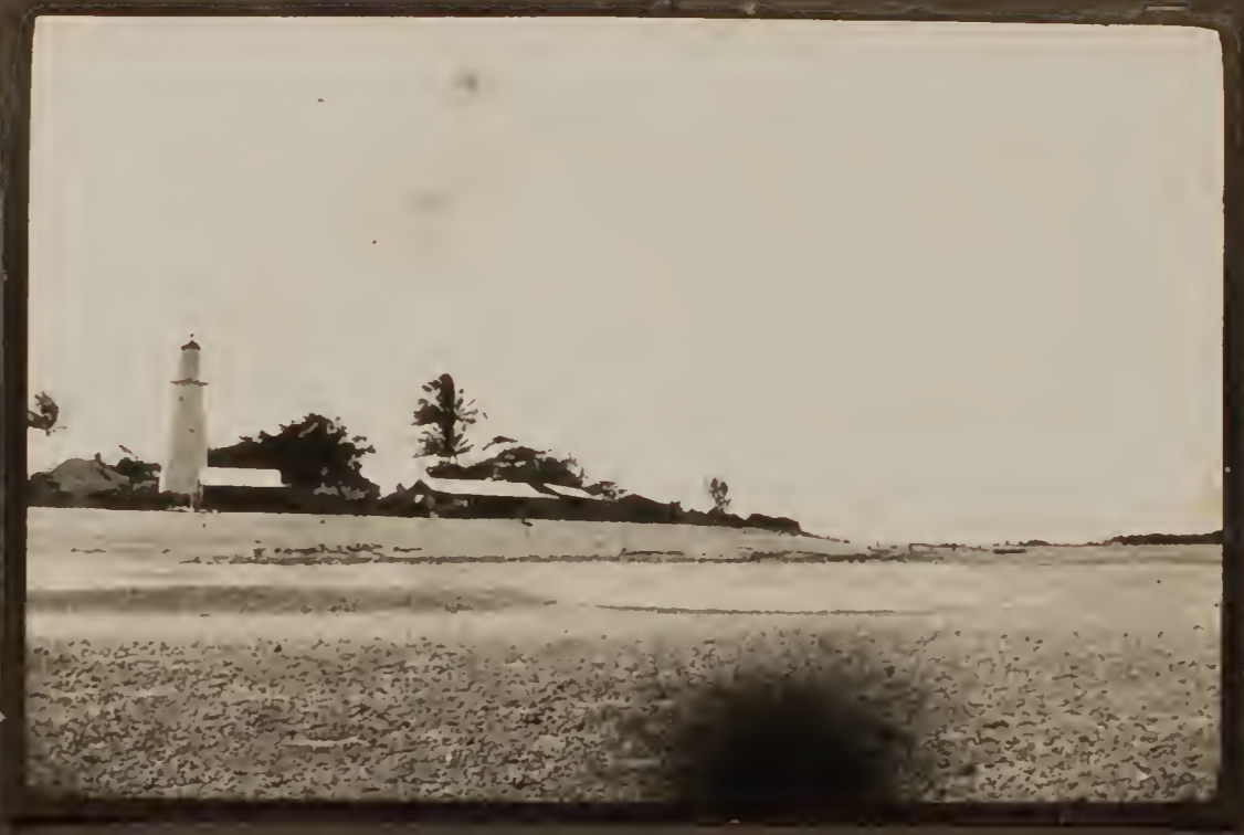
From Reef Flat showing Lighthouse